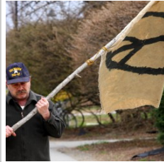
Rally aims to revitalize peace organization