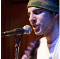
The rise of Spose: Maine rapper called up to the big show