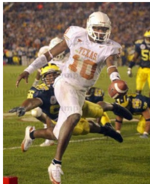
krt campus photos