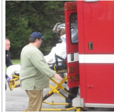
Missing UMaine student found