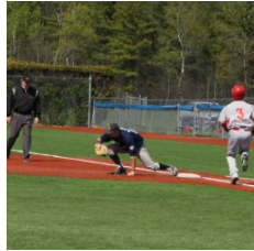
UMaine rallies, sweeps Hartford