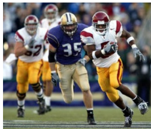
krt campus photos

Tell us what you think! Send a letter to the editor about this or any other article in The Maine Campus.