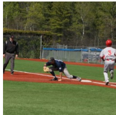
UMaine rallies, sweeps Hartford