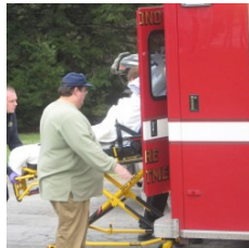
Missing UMaine student found