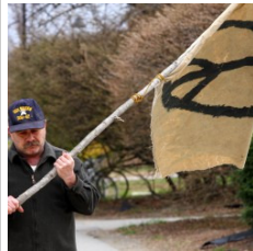
Rally aims to revitalize peace organization