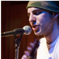
The rise of Spose: Maine rapper called up to the big show